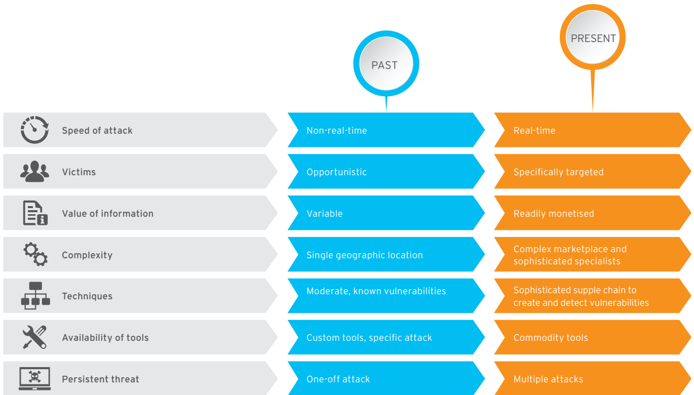
Diagram 2. Evolving Threats: An Illustration of the information Security Challenge

Treasury and Trade Solutions transactionsservices.citi.com